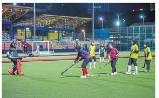
Selangor women's team performance has been commendable.