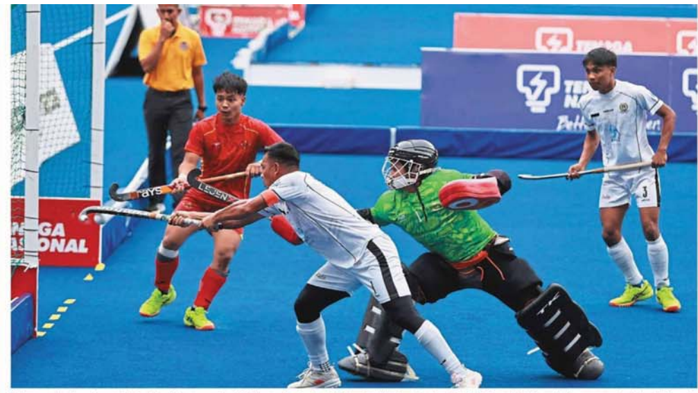
Selangor Hockey Association Men's team against Pahang during the Malaysian Hockey Federation's National Hockey 5s tournament at the National Hockey Stadium in Bukit Jalil, Kuala Lumpur.