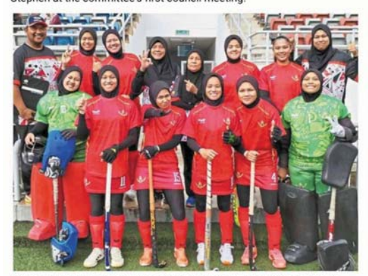
Selangor women's team ahead of the Malaysian Hockey Federation's National Hockey 5s tournament at the National Hockey Stadium. SHA wants to get more women in the state involved in hockey