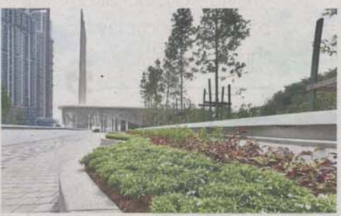
The Green Building Index-certified complex has a low carbon footprint as it uses LED lighting and recycles rainwater for its needs.