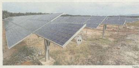
Malaysia's landscape presents a challenge for large-scale RE projects, especially large solar farms which require vast land areas

"The history of nuclear energy in Malaysia began during the time of former Deputy Prime Minister Tun Dr Ismail Abdul Rahman, with the establishment of the Tun Ismail Atomic Research Centre for the development of nuclear tech-