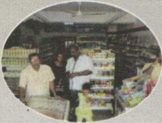
Kedai Runcit Pachu from Penang (Tariff B)