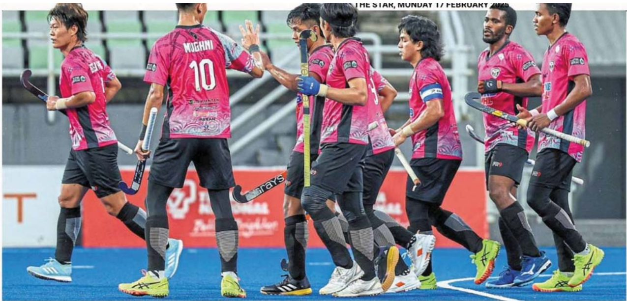
Peerless: Terengganu players celebrating their 4-1 win over Australia's Territory Stingers in the Malaysian Hockey League yesterday.