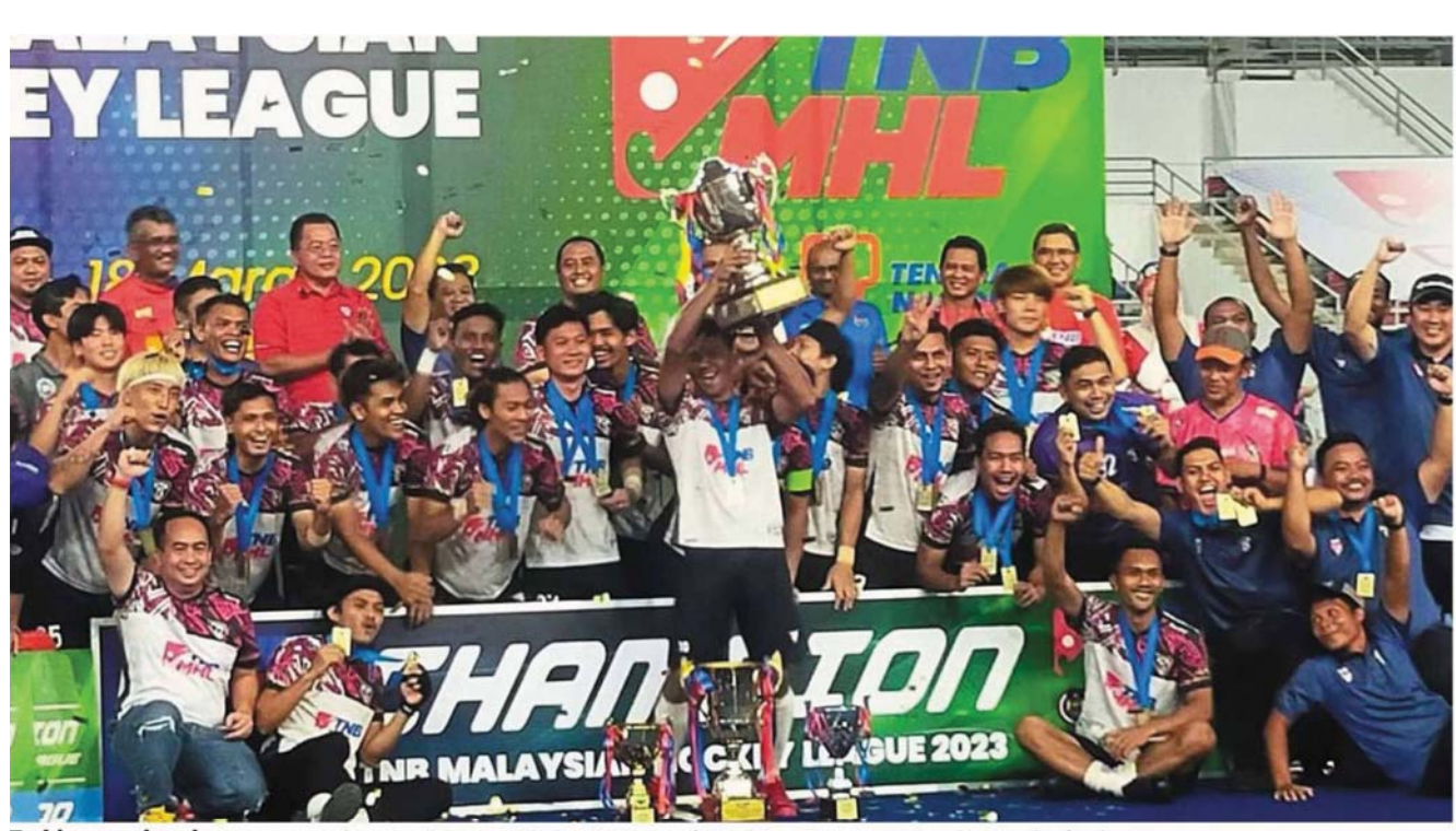
Treble completed: Terengganu players celebrate with the TNB Cup after edging Tenaga Nasional 2-1 in the final. >35